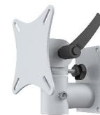
Part No. 2000492