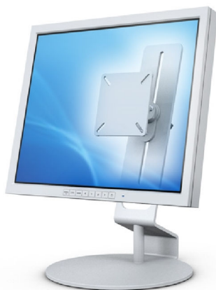
Part No. 2000398