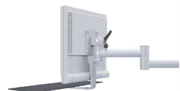
Part No. 2000494