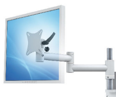
Part No. 2000490