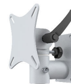
Part No. 2000492