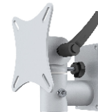
Part No. 2000492