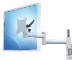
Part No. 2000490