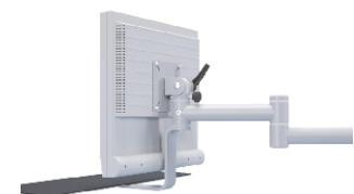
Part No. 2000494