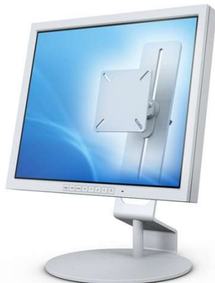
Part No. 2000398