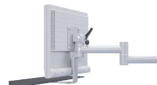
Part No. 2000494