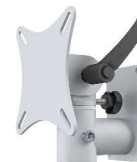
Part No. 2000492