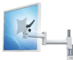
Part No. 2000490