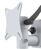
Part No. 2000492