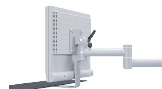
Part No. 2000494