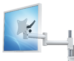
Part No. 2000490